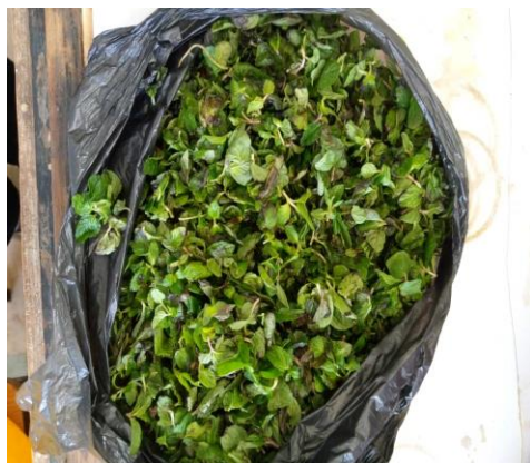
Plates 1: Chopped mint leaves ( Mentha piperita )