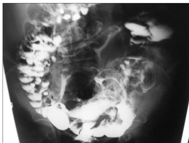
Figure 3: The barium enema of a 68-year-old woman with diverticular disease