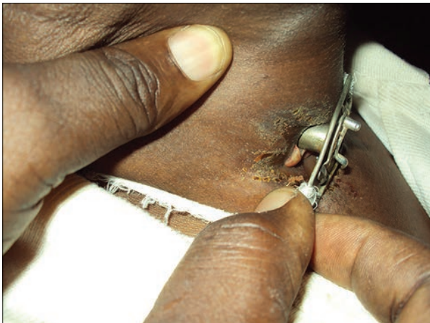
Figure 1: Polyp formation around stoma