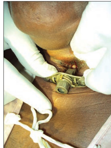
Figure 2: Soft tissue blockage of tube fenestration