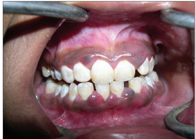
Figure 1: Non-migrated right maxillary lateral incisor and migrated contra lateral tooth

Pathologic migration in the presence of habits like bruxism, tongue thrusting, lip biting, finger sucking and conditions like high frenal attachment were not included in the study