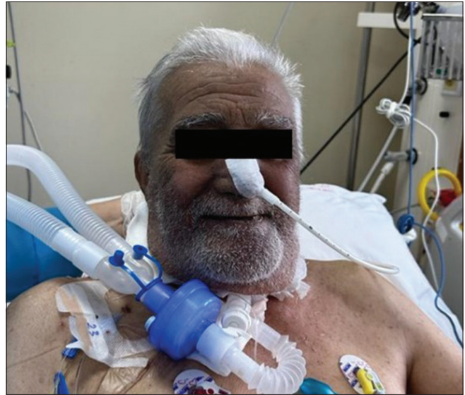
Figure 2: Head and facial hyper-pigmentation after Polymyxin B therapy

Polymyxins are prescribed more frequently due to the increasing incidence of infections caused by multidrug-resistant gram-negative bacteria in hospital settings. Nephrotoxicity is the most common side effect of polymyxin. [7] In addition to nephrotoxicity, mild and rare side effects of polymyxin, such as pruritus, rash, cough, and skin hyperpigmentation, have also been observed. [8]