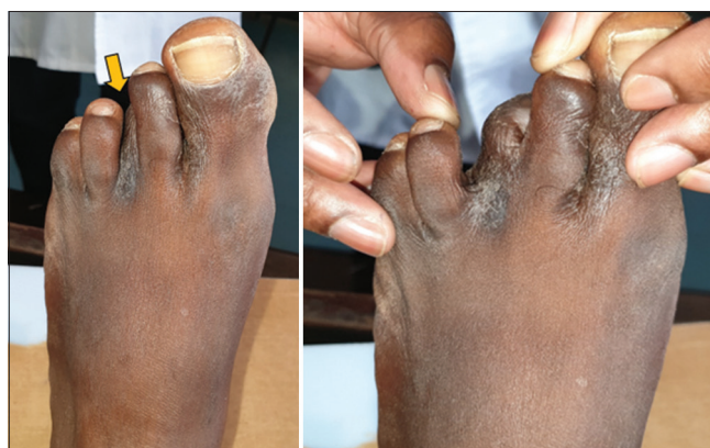
Figure 6: Shows abnormally rotated second and third digit of the left foot indicated by the yellow arrow with areas of excoriations on the skin of the adjoining digits

beneath the second digit. The skin overlying the crevices of the first three toes was noticed to be hyperpigmented and scaly. His elbows and knees were also noticed to be slightly flexed [Figure 5].