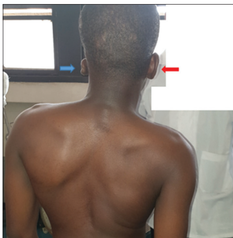
Figure 3: Highlights the low-set ears with abnormal pinna on the left, a short neck, and a low posterior hairline