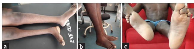
Figure 7: The hypoplastic right limb and left lower limb in (a and c), and right tallipes equinovarus and camptodactyl in the left foot are visible in (c)

was based on the clinical features noticed on clinical evaluation. He was referred to the cardiology unit for expert review and management in view of the ventricular septal defect. The patient was subsequently lost to follow-up.