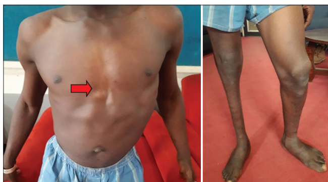
Figure 5: (a) shows the chest slightly rotated to the left, and the red arrow highlights pectus excavatum, and (b) shows the hypoplastic right lower limb and the normal left lower limb