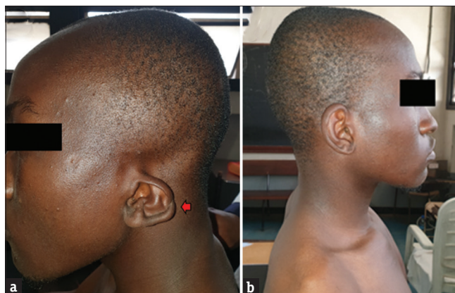
Figure 4: A shows a high-arched eyebrow, low set abnormal left pinna (red arrow) with thick helix and high anterior hairline and (b) shows high anterior hairline, low set normal pinna, short neck, and pointed chin