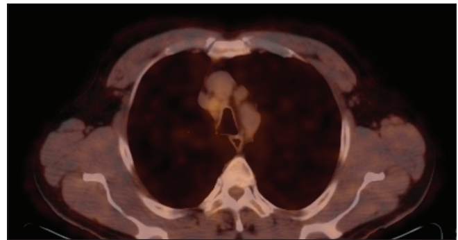
Figure 2: An 55-year-old male patient diagnosed with squamous cell carcinoma and had not detected distant metastasis in FDG-PET/CT scanning. Right paratracheal LNs short axis was 9 mm; SUVmax was 4.03; SUVmax LN/SUVmean MBP was 1.32 and SUVmax LN/primary tumor was 0.37. This node diagnosed as non-malignant after the histopathological examination. Only SUVmax LN/SUVmean MBP > 1.71 could characterized accurately this node