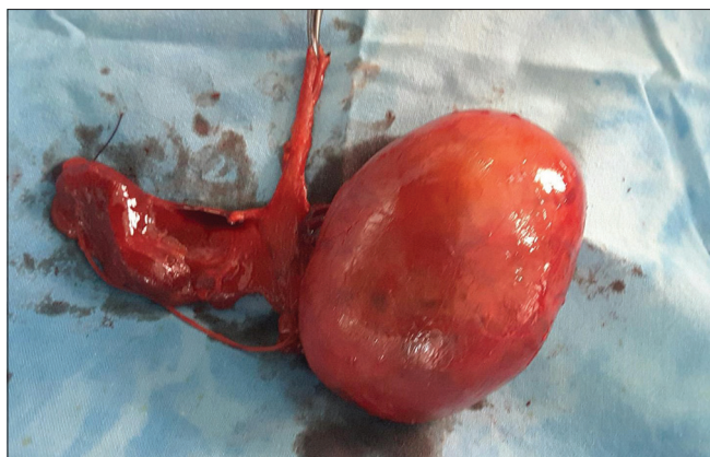
Figure 2: Post-total thyroidectomy picture showing a pyramidal lobe

Graves disease in 11 patients (15.7%) and no disease in the PL of 22 patients (31.4%) [Table 3].