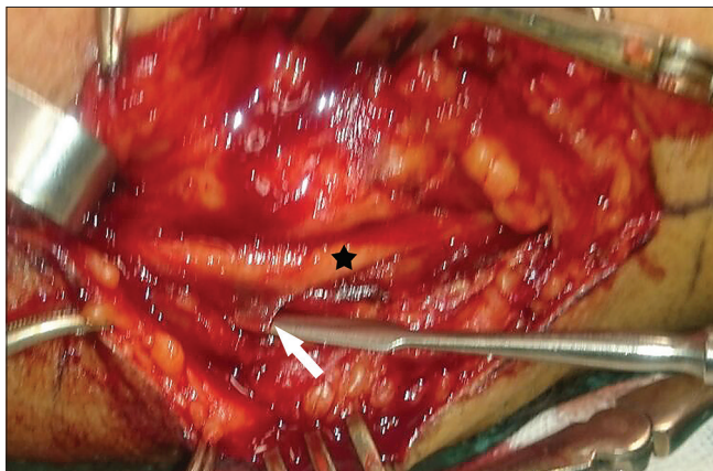
Figure 1: Perioperative photograph shows fascial band (arrow) of the ulnar nerve (star) in the cubital tunnel