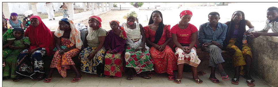
Figure 2: A group of Facial tumour patients presenting for screening at one of the outreach programmes in North Central Zone of Nigeria