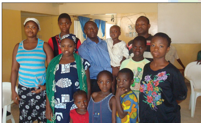
Figure 1: A group of facial cleft patients seen during one of the outreach programme in North Central zone of Nigeria

Epidemiological studies give an idea of disease pattern, predominance of certain conditions, and pattern of clinical behavior. This knowledge could assist in policy formulation to meet the need of a particular populace. The uniqueness of this study is that the data were generated from series of free surgical mission program across the North-central zone of Nigeria, compared with previous hospital-based reports. [2,13,14] In a report from Kano, Nigeria, [13] trauma accounts for more than half (55%) of maxillofacial surgical conditions and about a quarter (21%) being cases of tumors and allied lesions. This is not too different from about 46% due to trauma and 39% due to tumors and allied lesions recorded in another study. [14] Free surgical missions are organized periodically and hence traumatic cases, which are accidental, are not usually part of the spectrum; only six cases were recorded in our study. However, the present study recorded more than half (57%) of the patients being facial clefts, whereas the rest were tumor and