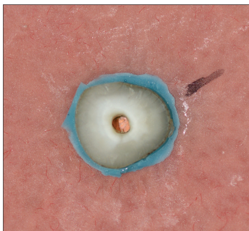
Figure 1: Specimen with standardized silicone layer, which simulated the periodontal ligament

MTA placement (MTA Angelus or Micro Mega MTA) did not significantly increase the fracture resistance of