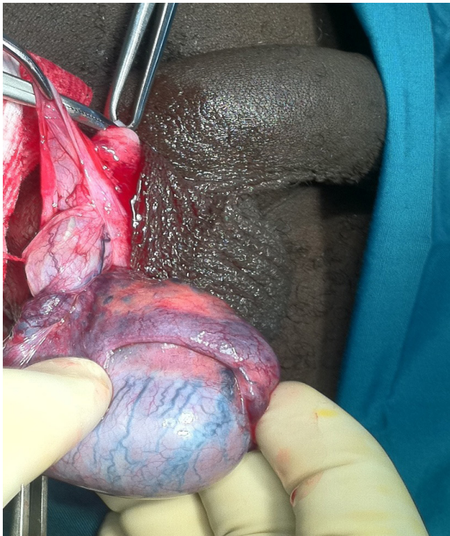
Figure 1: Bluish torted right testis