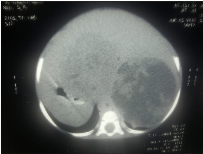
Figure 1: Computed tomography abdomen showing a retroperitoneal suprarenal hypodense mass