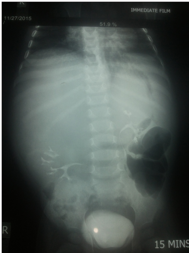
Figure 2: Intravenous urogram showing abnormal location of both kidneys, with more inferior displacement of the right kidney by the extrarenal. The outlined ureters and urinary bladder appear normal with prompt excretion of contrast bilaterally

downward displacement of middle and lower moiety of the right kidney by a huge hypodense soft tissue mass [Figure 1] without any evidence of obstruction of the right kidney. Intravenous urogram showed good and prompt excretion bilaterally by abnormally located