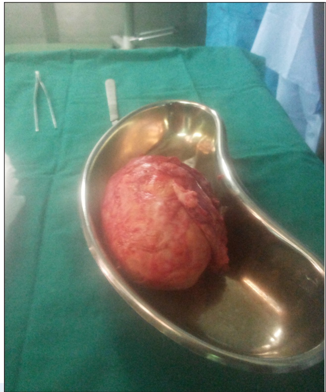
Figure 3: Post excision specimen of the extrarenal retroperitoneal tumor

downward displacement of middle and lower moiety of the right kidney by a huge hypodense soft tissue mass [Figure 1] without any evidence of obstruction of the right kidney. Intravenous urogram showed good and prompt excretion bilaterally by abnormally located