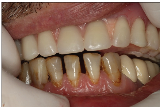
Figure 5: Occlusion with left maxillary and mandibular teeth

placed in the patient's mouth, and the patient's speech, the occlusion, and the soft tissue harmony of the prosthesis were appraised. Hygiene procedures were explained, and controls were performed at the 1 st week and 1 st month after delivery of the prosthesis. At the end of the 1 st year, the patient was satisfied his prosthesis.