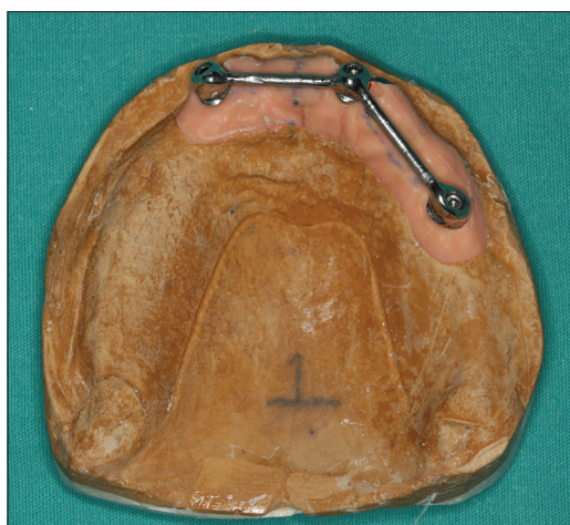
Figure 3: Bar and clips attachments