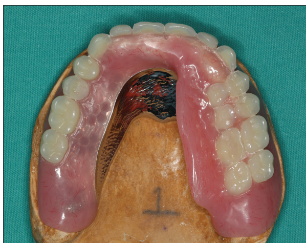
Figure 4: Definitive maxillary bar-retained overdenture