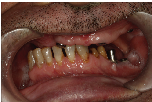
Figure 1: Intra-oral view of the mandible positioned toward the surgical side

The bar-retained maxillary implant-supported denture and fixed metal-ceramic mandibular prosthesis were then