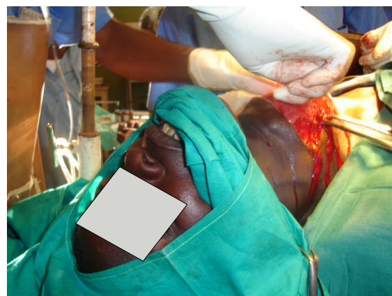
Figure 1: Modified Draping For Thyroidectomy Under Local Anaesthesia