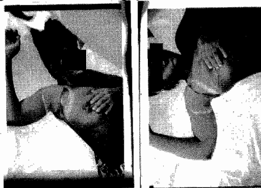
Figure 2 : one week after surgery

Examination revealed an otherwise healthy lady with a pendulous 19 X 18 cm fowl-smelling mass in the right axilla clearly separate from the right breast [fig 1,2]. The mass was firm, fairly mobile and ulcerated through the skin in the medial aspect [but not attached to the skin edge], and was free of attachment to deeper structures. An initial diagnosis of ulcerated cystosarcoma phylloides in an axillary breast was made. At surgery the mass was necrotic distally and was superficial to the subjacent clavipectoral fascia. Large draining veins contained thrombi. Post-operatively a wound infection healed rapidly. Histology revealed ulcerated breast tissue with disruption of normal lobular Architecture, massive eosinophilic