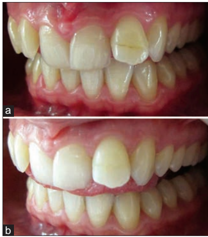
Figure 3: One year follow-up (a) marginal discoloration (b) easily removed by polishing