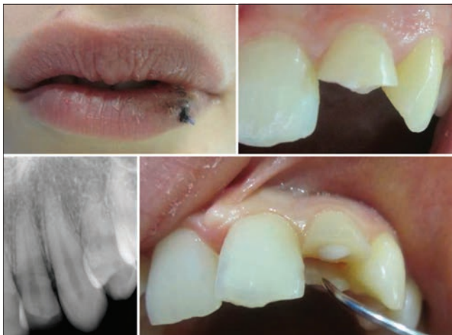
Figure 1: Images of injury of a fractured maxillary left lateral incisor

A healthy 11-year-old female patient referred for an aesthetic restoration of a fractured maxillary right central incisor (11) [Figure 5]. Dental history revealed that the tooth was fractured 1 month prior to presentation because of a bicycle accident. Her first dentist applied a root canal