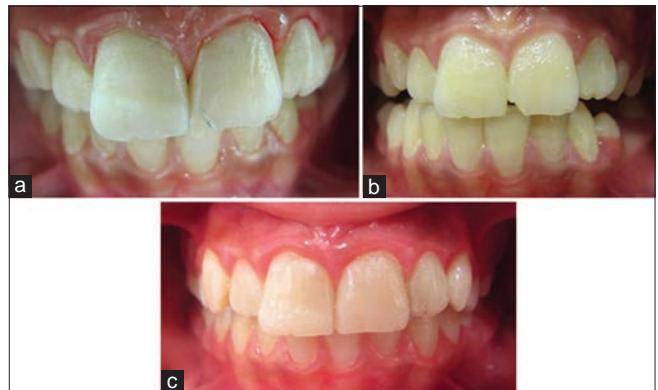
Figure 6: Postoperative images (a) immediately after reattachment showing dehydration (b) acceptable color in 2 weeks control (c) 1-year follow-up

treatment and suggested a temporary composite restoration until a crown restoration at the age of 18 for better clinical results. The parents hesitated for a final crown restoration and referred our university clinics in order to find a remedy. As they were informed about the treatment alternatives of a fractured tooth, her mother gave us the dehydrated fragment she kept with her ever since the accident. The fragment was placed in 2% chlorhexidine digluconate solution for disinfection and tried intraorally to check for proper positioning and fit with the fractured coronal structure. A written informed consent was signed by the patient's mother as the guardian before the treatment. Following clinical and radiographic examination, the endodontic treatment was found to be successful but a horizontally located mesiodense in the apex area was noticed. Since the lamina dura surrounding roots of both teeth could be detected separately, the mesiodense was followed-up closely for future recalls. The fragment and the tooth were acid etched for 30 s with 37% phosphoric acid gel, rinsed for 30 s and gently air dried. A one-bottle etch and rinse adhesive (Adper Single Bond 2, 3M ESPE, USA) was applied with a brush for 20 s and carefully air thinned. Flowable composite was placed over the fracture area on the tooth, and the fragment was placed over. The excess material was removed before light-curing for 40 s from labial and