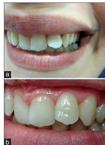
Figure 2: Postoperative images (a) immediately after reattachment showing color difference because of dehydration (b) harmonious integration of color in 2 weeks control