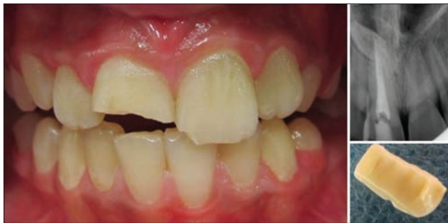
Figure 5: Preoperative images of a fractured maxillary right central incisor

treatment and suggested a temporary composite restoration until a crown restoration at the age of 18 for better clinical results. The parents hesitated for a final crown restoration and referred our university clinics in order to find a remedy. As they were informed about the treatment alternatives of a fractured tooth, her mother gave us the dehydrated fragment she kept with her ever since the accident. The fragment was placed in 2% chlorhexidine digluconate solution for disinfection and tried intraorally to check for proper positioning and fit with the fractured coronal structure. A written informed consent was signed by the patient's mother as the guardian before the treatment. Following clinical and radiographic examination, the endodontic treatment was found to be successful but a horizontally located mesiodense in the apex area was noticed. Since the lamina dura surrounding roots of both teeth could be detected separately, the mesiodense was followed-up closely for future recalls. The fragment and the tooth were acid etched for 30 s with 37% phosphoric acid gel, rinsed for 30 s and gently air dried. A one-bottle etch and rinse adhesive (Adper Single Bond 2, 3M ESPE, USA) was applied with a brush for 20 s and carefully air thinned. Flowable composite was placed over the fracture area on the tooth, and the fragment was placed over. The excess material was removed before light-curing for 40 s from labial and