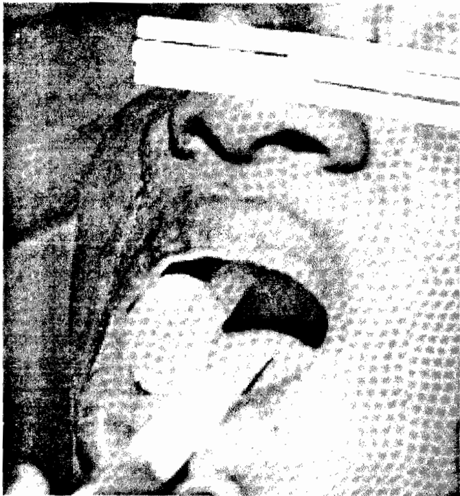
Figure 3: Further intral-oral examination revealed 2 big chunks of calculus inter locked together.