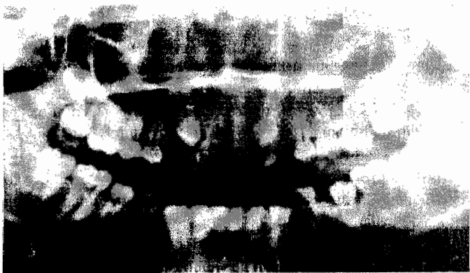
Fig. 1: A Panoramic x-ray of a 14 year old boy showing bilateral impaction of the maxillary canines.

Moss observed that the frequent displacement of the canine is probably due to its high developmental position and advanced state of development of the crown at an early age 20 . Bishara et al pointed out numerous causes including the rate of resorption of primary teeth, trauma to the primary tooth bud, disturbance of tooth eruption sequence, rotation of tooth buds and premature root closure 21 . Early trauma to the permanent incisor teeth has also been reported as a possible cause of canine impaction 22 . Several authors implicated crowding or lack of space within the arch as a frequent cause of canine impaction 1,5,7,21 . This usually results in buccal displacement (Fig. 1). Jacoby 13 however noted that in 85% of palatal impactions there was adequate space to allow for eruption of the canine. This finding is supported by a recent finding showing that patients with (impacted) palatally displaced canine had significantly smaller than average teeth 23 and are therefore likely to have adequate arch space. However, the results of a related study showed no statistically significant differences between arch size of patients with palatally impacted canines and a control sample 24 .