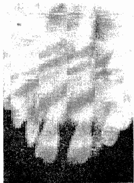
Fig. 2: An unerupted upper left canine associated with peg-shaped lateral incisors in a 19-year old female.

Follicles of ectopically erupting canines have been reported to be larger and more asymmetric in shape than those of normally erupting canines 30 . Unerupted canines may also be seen in con-