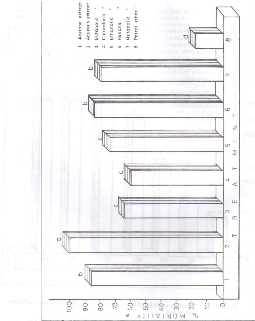
Figure 2: Percentage mortality of Myzus persicae in different formulations of neem seed.

*Peaks with the same letter do not differ significantly ( p = 0.05 ) using Duncan's test.