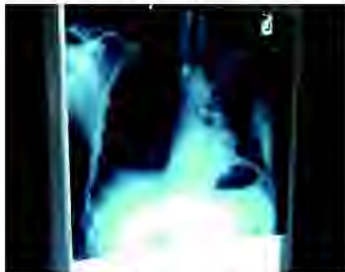
Fig.3a; Chest radiograph PA View immediate postoperatively