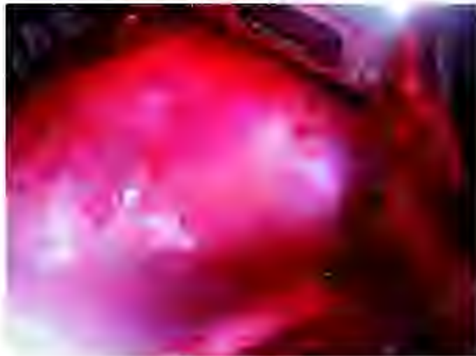
Fig.2a; The mass seen after exposing the left hemithorax during surgery