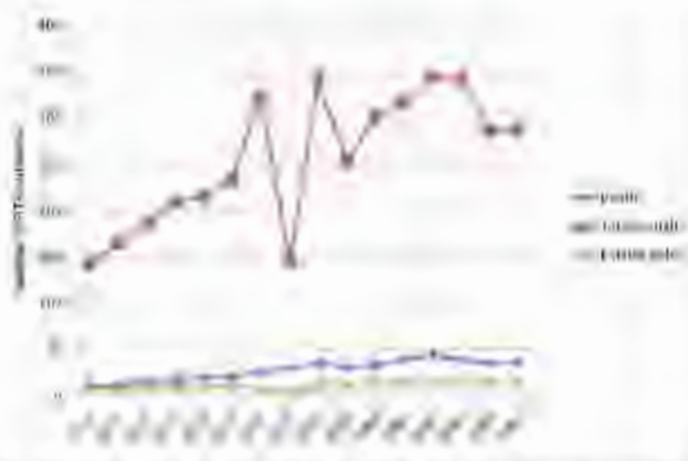
Fig. 1: Time series chart of total casualties, death and fatality index by year for Pre-enforcement period (1970-1985)

In the pre-enforcement period from 1970 to 1985 (table 1), there were a total of 4211 accidents, out of which fatal accidents constituted only 15%, deaths recorded were 439 and total casualties were 4075 per 100,000 of the population.