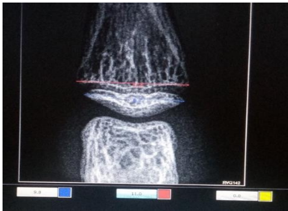
Figure 1. Digital peri-apical radiographic view of the middle phalanx of the third finger of a study participant.