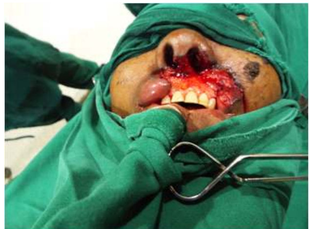
Fig. 1: Erosion of the entire thickness of the upper lip

size. She was therefore referred to the Oral and Maxillofacial Surgery Clinic. Examination revealed an ulcer that had eroded the entire thickness of the upper lip, sparing only about 1 cm on the right upper lip and terminated at the lip commissure on the left side, the nasal floor was also affected along with the inferior portions of the nasal alar bilaterally as well as the columella (Fig. 1).