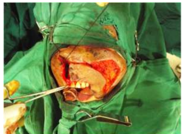
Fig. 4b: The left nasiolabial flap rotated medially.