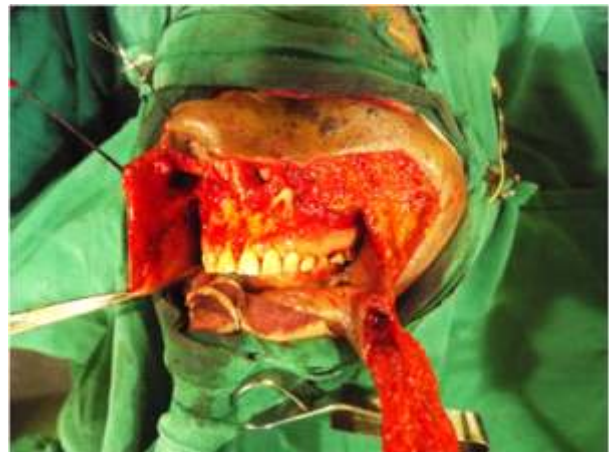
Fig. 4a: A full thickness nasolabial flap based on the inferior labial artery was raised on the left side

A full thickness nasolabial flap was raised on the left side based on the left inferior labial artery; the skin was undermined and mobilized (Fig. 4a). The left nasolabial flap was rotated medially to meet the advanced peri-alar crescentic flap (Fig. 4b); the superior part of the nasolabial flap was used to reconstruct the nasal floor, columella base and the alar bases bilaterally.