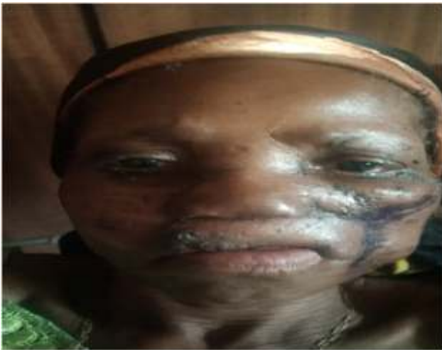
Fig. 5: Upper Lip Reconstruction

Suturing was done in layers with 3/0 vicryl suture subcutaneously and skin closure done with 4/0 nylon suture. The raw surfaces of the upper labial sulcus and the nasal floor were dressed with sulfratulle gauze. The patient was discharged home 5 days postoperatively and had sutures removed at the one-week post operative review (Fig. 5).