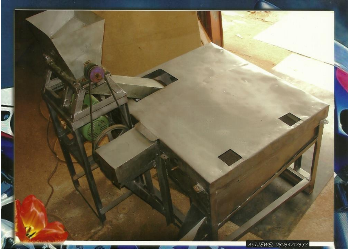
Fig. 2: A photograph of the completed machine