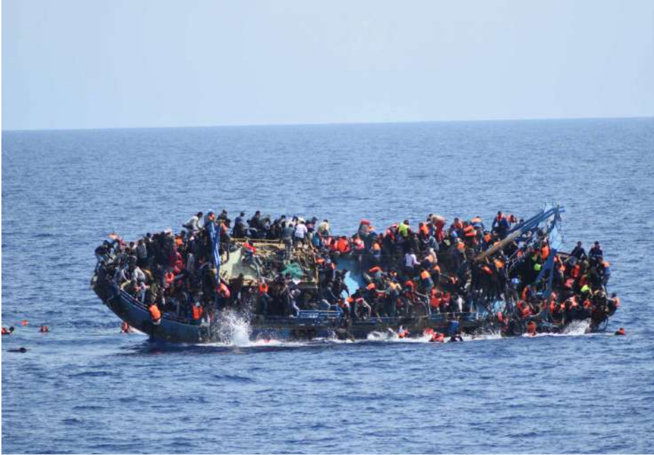
Refugees risk a perilous journey