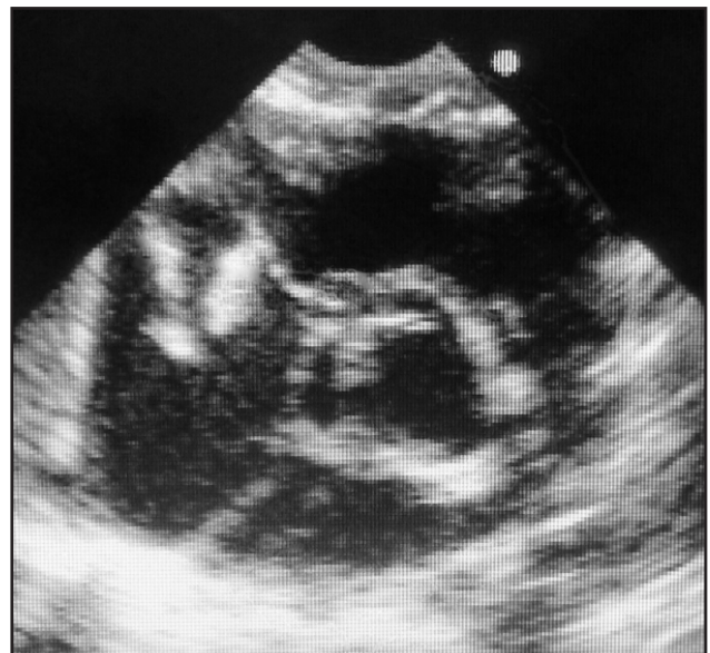
Figure 2: Parasternal short axis echocardiogram showing tricuspid valve vegetations (labelled 'V') in right atrium during systole. RA - right atrium, RV - right ventricle, A - aorta.

In view of her chest x-ray, an echocardiogram was done which showed a large oscillating intracardiac mass (vegetation) on the tricuspid valve and tricuspid valve regurgitation. There was no other cardiac abnormality, in particular no ventricular septal defect or left to right shunt producing a jet impacting on the tricuspid valve (Figures 2 and 3).