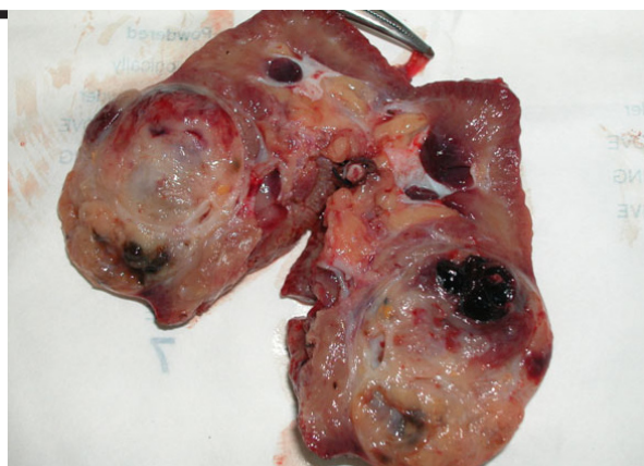
Figure 2. Operative specimen showing well demarcated tumour in the lower pole of the kidney