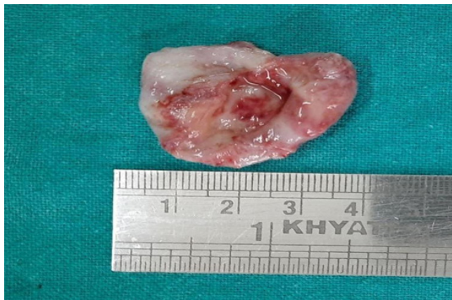
Figure 4: Figure showing excised lesion

palatine nerve blocks were given. After ensuring complete anesthesia, crevicular incision was given from 24 to 28 region with a relieving incision distal to canine. Mucoperiosteal flap was reflected. There was thinned out bone at the apical third of 27,28 region, which was trimmed, explored and complete excision of the cyst was done, followed by careful application of Carnoy's solution (Figure 3,4). Suturing was done after thorough irrigation.