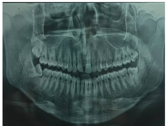
Figure 1: Orthopantomograph showing the extent of the lesion

A male patient aged 28 years reported to the Department of Oral and Maxillofacial Surgery, Government Dental College and Hospital, Hyderabad with a chief complaint of foul odor and dull pain that had been present for the previous three months in the left maxillary posterior teeth region. The discomfort was dull, sporadic, and occasionally accompanied with pus discharge. Intraoral soft tissue examination revealed a diffuse unnoticeable swelling in the 27,28 region associated with tenderness on palpation with respect to mucobuccal fold of that region. Intraoral hard tissue examination revealed dull sound on percussion in the 28. OPG and CT scans revealed a well-defined radiolucent lesion associated with root apices of 27,28 extending and involving the left maxillary sinus. (Figure 1,2). On aspiration, a dirty, creamy white fluid was drawn and the FNAC study showed the presence of squamous and an abundance of