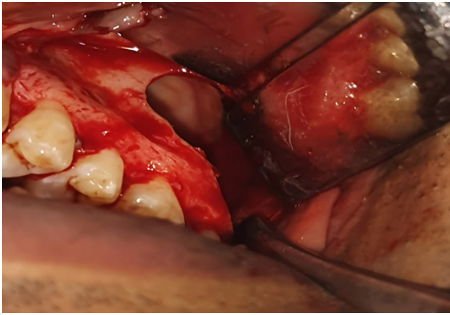
Figure 3: Figure showing residual cavity after enucleation of the cyst