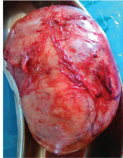
Figure 2: Excised leiomyoma after myomectomy

The uterus was elevated out of the abdominal cavity and myomectomy of the large tumour was achieved through a fundal incision. The excision site was closed with continuous catgut sutures, and the abdomen was closed in layers. Cut section of the gross specimen revealed whitish nodules with a whorled appearance and fibroelastic consistency suggestive of benign leiomyoma (Figure 3). The specimen was sent for formal histopathology. Results of histopathological examination confirmed the diagnosis of a benign fibroid of the uterus.