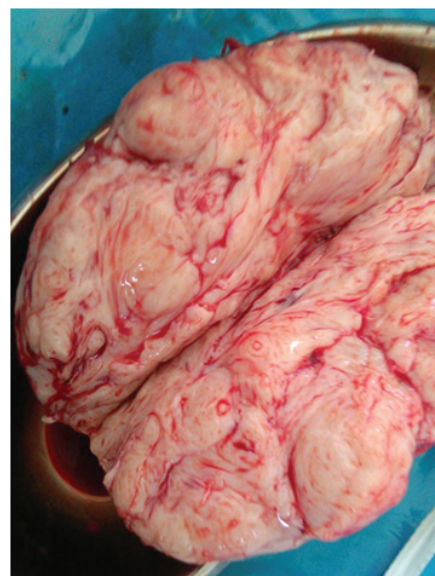
Figure 3: Sectional view of excised leiomyoma, showing the typical nodular, whorled appearance, and fibroelastic consistency

The uterus was elevated out of the abdominal cavity and myomectomy of the large tumour was achieved through a fundal incision. The excision site was closed with continuous catgut sutures, and the abdomen was closed in layers. Cut section of the gross specimen revealed whitish nodules with a whorled appearance and fibroelastic consistency suggestive of benign leiomyoma (Figure 3). The specimen was sent for formal histopathology. Results of histopathological examination confirmed the diagnosis of a benign fibroid of the uterus.