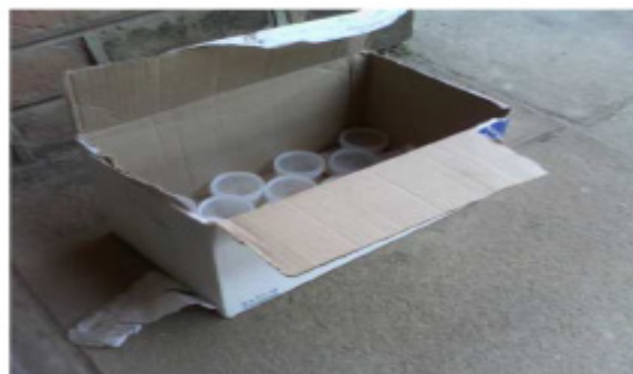
Figure 1: Improvised transportation boxes

Chileka Health Centre had no disinfectants. The already prepared reagents were not properly labeled. And the biosafety cabinet was not working properly.