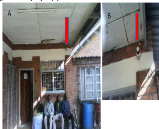
Figure 2: Improperly placed exhaust ducts at Limbe Health Centre.

At Lirangwe Health Centre, there was no electricity