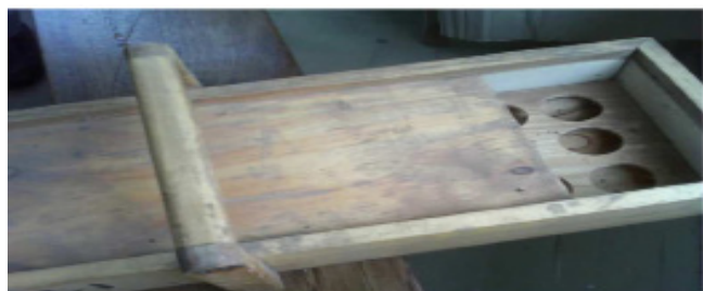
Figure 3: An ideal sputum transportation box at Lirangwe Health Centre

At Zingwangwa Health Centre there were no biohazard bags. The direction of air in the biosafety was from dirty to clean area. There were no biohazard bags and some staining reagents such as phenol solution.