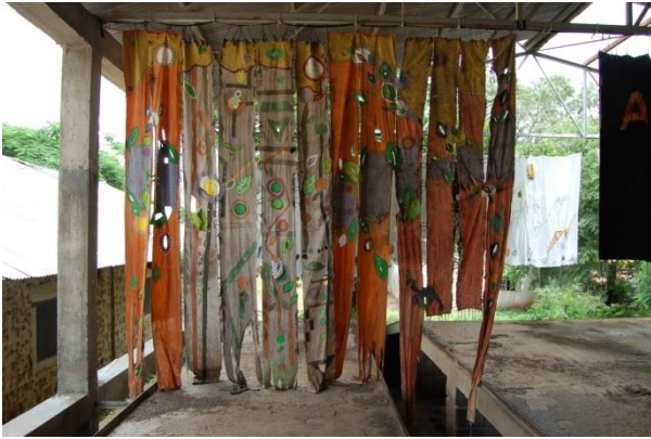
Fig. 7, Blaise Gundu Gbaden, Wall of Power , 2010, hanging, canvas, acrylics and ropes, 386cm x 450cm, (Source: Gbaden 2014)

Wall of Power (Fig. 7) was originally conceived as a forest region where the Lion holds sway as king of the animal kingdom. An important choice for a forest was the inspiration the researcher got from the thousands of falling leaves which litter the painting site on the premises of the Ahmadu Bello University where the painting was initially conceived and installed. Huge mahogany trees, decades old, cover the site with several ancient ideas for art to spring forth. The image of the lion was to be painted striding across the canvasses to show its agility and control of the forest zone. Imagine a lion roaring in the evening after a meal. The metaphor of a terror of the forest seemed to fit the power structure of Nigeria where greedy leaders amass wealth at the expense of the people. They feed on helpless victims, seize their rights, belch and blow the stench in their faces. The absence of the lion was a deliberate manipulation of the pictorial space; would the image not tarnish what was being painted as a curative process; would the aesthetic not be superfluous? Anyway, it was left out for another composition. Left out too are texts; none were found adequate to express power (Gbaden, 2014).