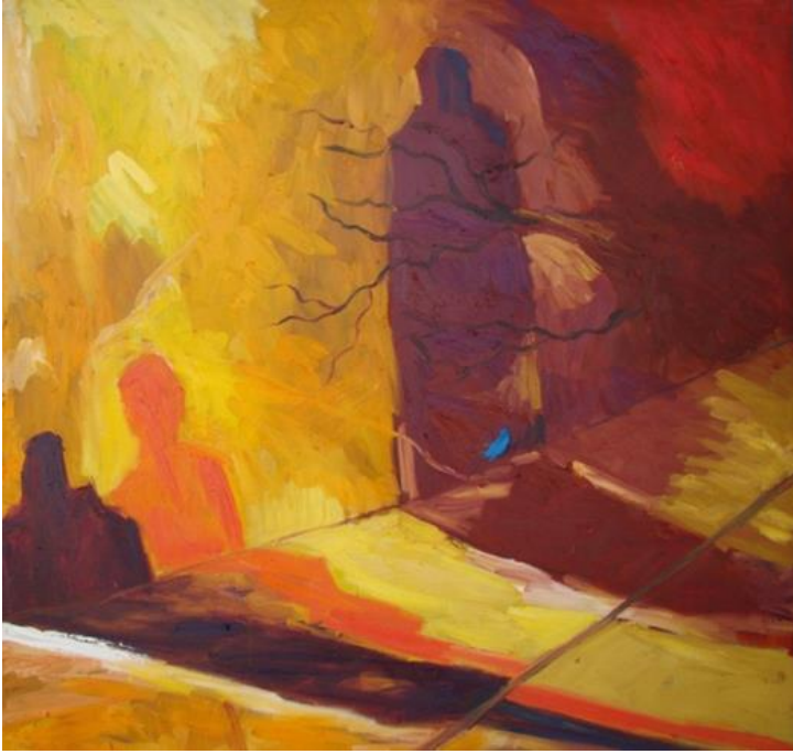
Fig. 8, Emmanuel Ikemefula Irokanulo, Corridor of Power , 2010, Oil on canvas 120x120cm