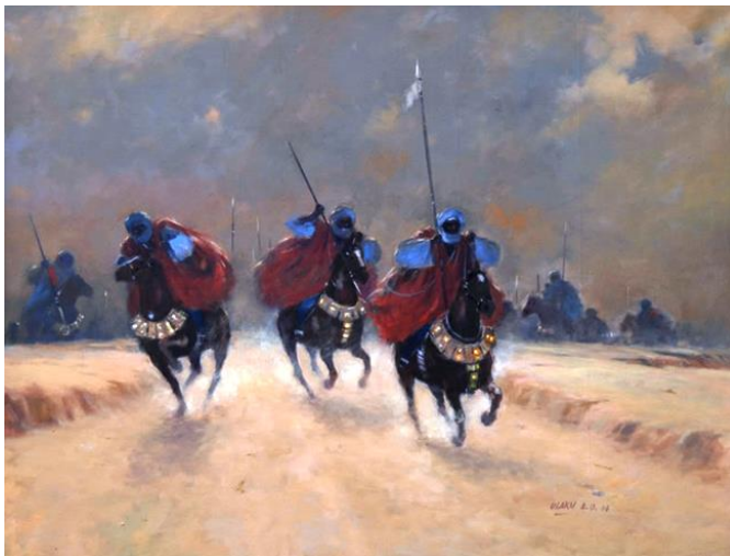
Fig. 6, Abiodun Olaku, Untitled , Oil on Canvas, 2008

Abiodun Olaku (b.1958), a Lagos based artist, is one of such painters who often uses idealised equestrian forms as source of inspiration for most of his painting compositions. It is unlikely that Olaku travels to the northern part of Nigeria to study durbar processions and horse races in order to enable him get a proper perspective on the details and nuances of horsemanship and the paraphernalia that accompanies it. Just like his fellow crop of Lagos based artists, such as Edosa Oguigo (b.1961), the horse rider has become his perfect choice for the derivation of power imagery (see Fig. 6 below). Here what the viewer can see are peripheral adornments for the horses, flowing robes of the riders, the brandished spears and an arid landscape, the expected stereotype backdrop.