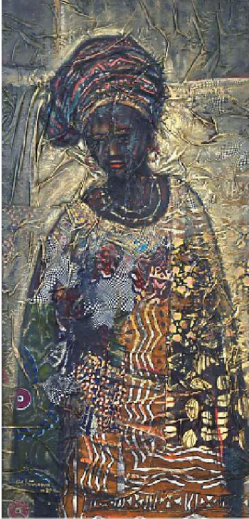
Fig. 1, Kolade Oshinowo, Matriarch II , Mixed Media on Canvas, 122 x 60 cm, 2011, (Source: Oshinowo, 2012)

Oshinowo's painting reveals a truth that is candidly bitter. That the female folk are great power wielders. One would think that in an African setting it is the man that has the final say. But can we be really sure looking at the Matriarch II in her assured stance that any king can withstand her gaze of authority, her certainty of purpose, her resolute drive? Do we know for sure the sort of negotiations that go on in the locked up bedrooms of Nigerian homes? Are the women compliant on their home tuff or in control of what takes place behind those closed doors?