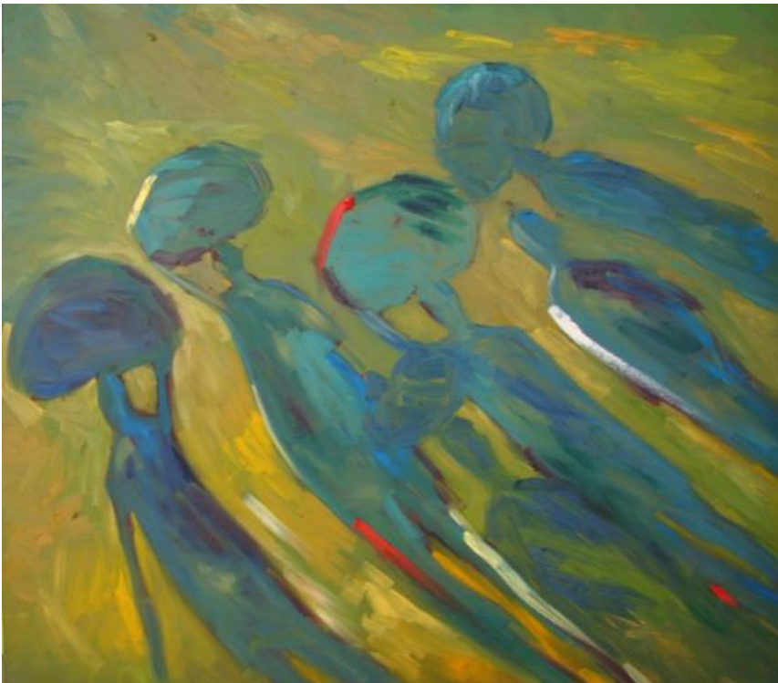
Fig. 9, Emmanuel Ikemefula Irokanulo, Exodus , Oil on canvas, 2010, 120x120cm

The second painting by Irokanulo (Fig. 9) depicts people moving, as if on an exile trail. For some years now, the North eastern part of the country has witnessed upsurges of relentless insurgency. The struggle of the Islamic terrorist sect Boko Haram, has left the people with no choice than to move away from the crisis prone zone. This exile and fleeing from the fighting environment presents the artist with a metaphor of experience; it enables