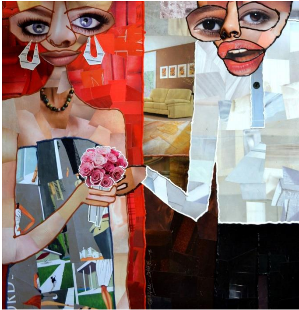
Fig. 2, Chike Obeagu, Give and Take , Mixed Media, 76x79cm, 2013

Obeagu's Give and Take means that both parties are exercising their ability to put their power to play for gainful advantage. As the female receives gifts of enticement from the male she gets what she wants and he gets his craving satisfied. It is a selfish act but each party believes that the upper hand is his or hers. The power to bargain is seemingly tied up in a sexual game on the superficial scale but it goes way beyond this level. This ability to conquer the opposite sex is a life and death game that determines who wins the gender domination game. Where one gets there by guile and cunning the other uses seduction and submission. Where one is on top gaining an upper hand by brute force the other reaches the apex of satisfaction riding on his back. The ability to bargain and negotiate the easiest and smoothest of terms without causing much damage the better for the survival of the species.