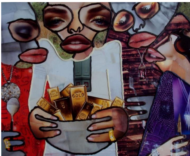
Fig. 3, Chike Obeagu, National Cake (Divide and Loot) , Mixed Media Collage, 2009, 62 x 75cm, (Source: the artist)

Obeagu's Give and Take means that both parties are exercising their ability to put their power to play for gainful advantage. As the female receives gifts of enticement from the male she gets what she wants and he gets his craving satisfied. It is a selfish act but each party believes that the upper hand is his or hers. The power to bargain is seemingly tied up in a sexual game on the superficial scale but it goes way beyond this level. This ability to conquer the opposite sex is a life and death game that determines who wins the gender domination game. Where one gets there by guile and cunning the other uses seduction and submission. Where one is on top gaining an upper hand by brute force the other reaches the apex of satisfaction riding on his back. The ability to bargain and negotiate the easiest and smoothest of terms without causing much damage the better for the survival of the species.