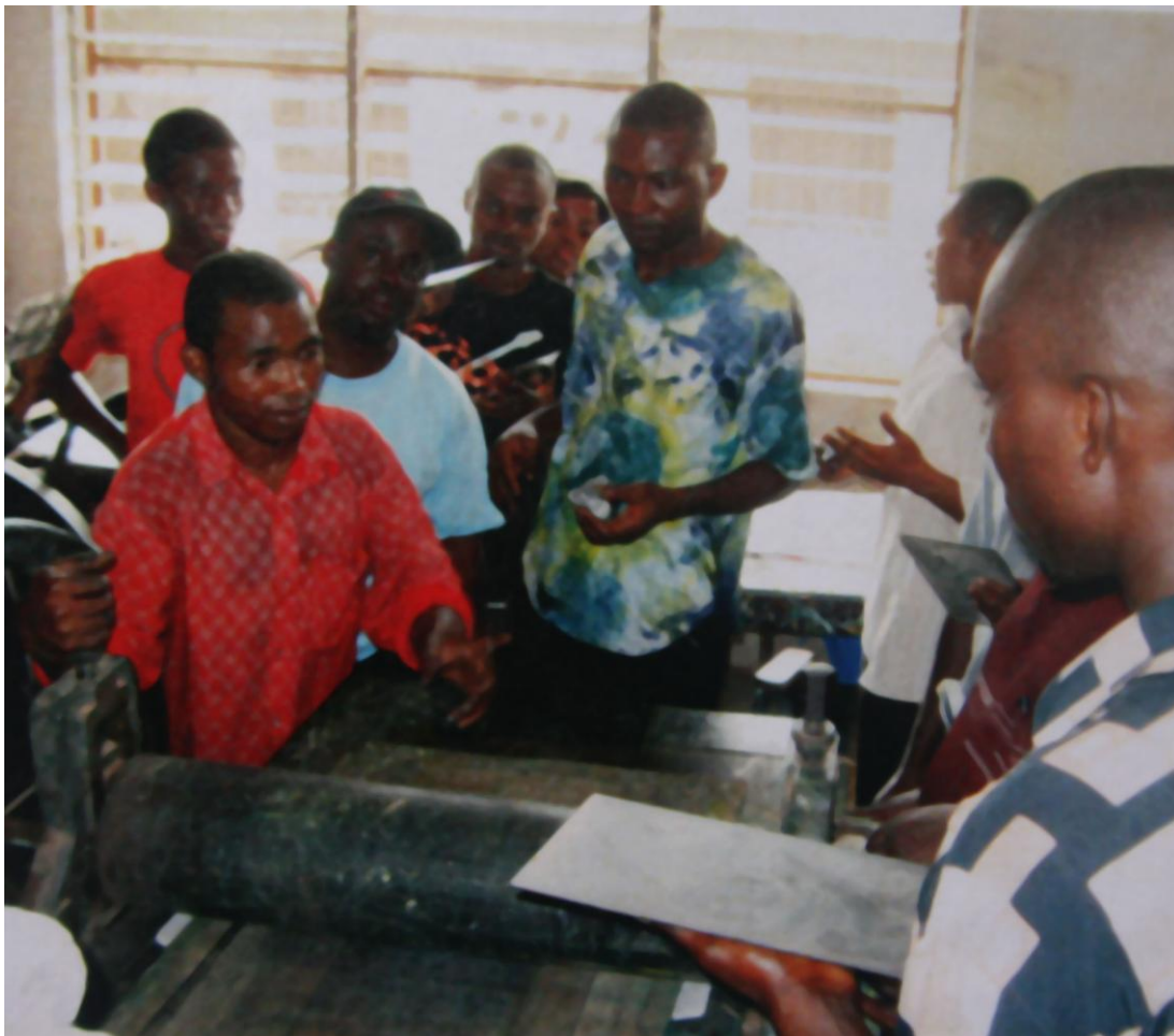
Fig. 5: Prepared plates about to be run through the press

In the workshop, the resource person first demonstrated the intaglio facet of collagraphy. She applied paste on thick paper cut to the size of the proposed print, stamped the brim of a bottle cover all over it and glued a piece of cheese cloth on a selected part of the plate. When it had dried, it was inked and run through the press (fig.5).