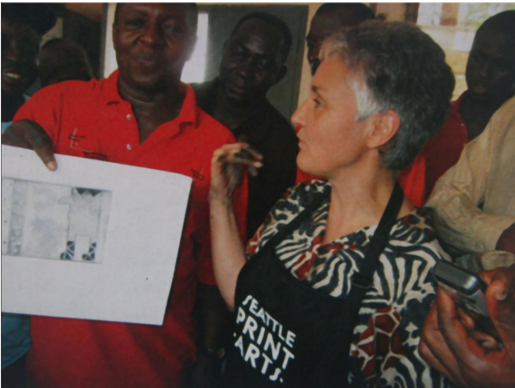
Fig. 6: The first successful print in the workshop

For one thing, Colligraphy is one of the most experimental methods of printmaking. In the workshop, several approaches were tried to prove so. The first was the “blind” technique where the prepared Colligraphic plate passed through the press without inking, thus outputting an embossed impression worth displaying as a finished piece of art. In the “viscosity” printing, Dionne mixed ink and linseed oil to a creamy state and used roller to apply it on the relief surface of one part of the plate, leaving the other inked as an intaglio block. Then the impression was taken. She furthered the process by dropping two colours on the palette. Using the roller on them, she moved her hand sideways to enable the two colours mix at a point. The “splint rainbow” approach as she termed it was a fitting description of the rainbow-like result of the mixture which was applied on the raised surface of the plate already inked with intaglio output in mind. The outcome was a crossover between relief and intaglio. In the end, the prints produced both in drypoint and collagraphy were pulled together and exhibited in the Ana Gallery located in the department (fig. 8).