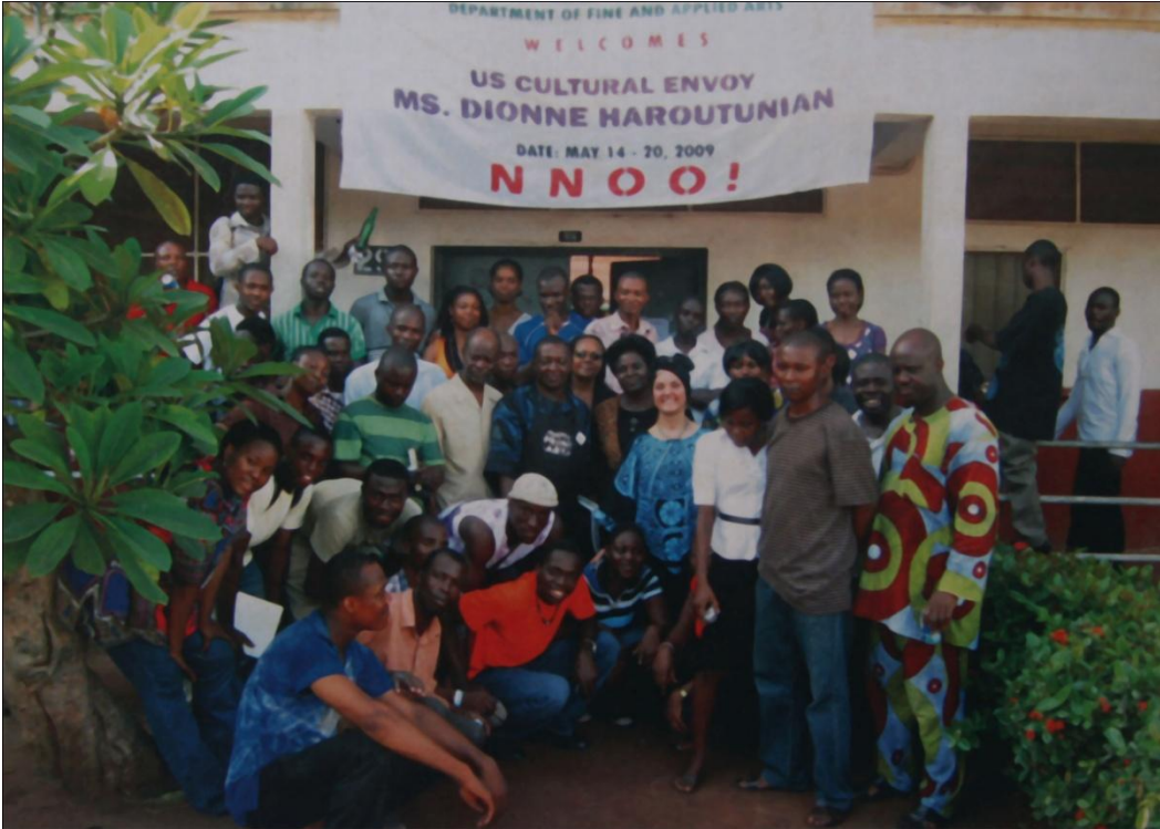
Fig. 1: The workshop participants

seemed to be broken. While no one can account for the reason, the situation could be attributed to the breaks, shifts, disconnections and other historical circumstances that shape the making of art history.