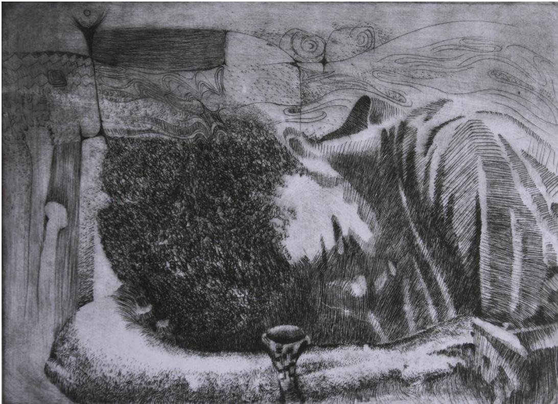
Fig. 7: NUGA Hangover Drip point produced in the workshop Artist: Agbo George Emeka Size: 24 X 21cm