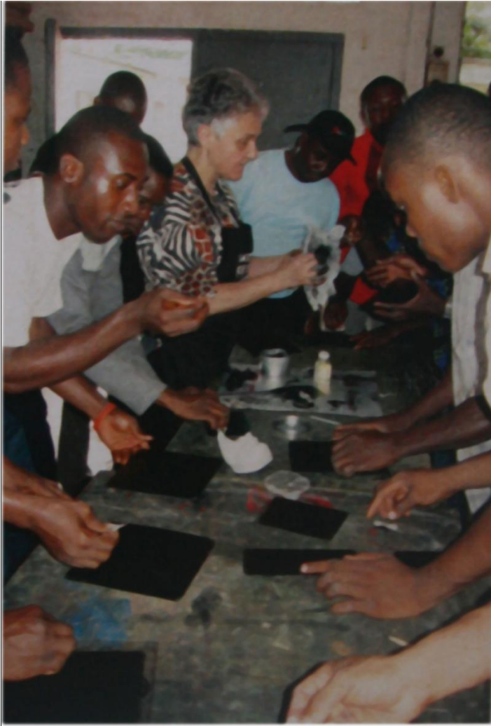
Fig. 3: Inking session