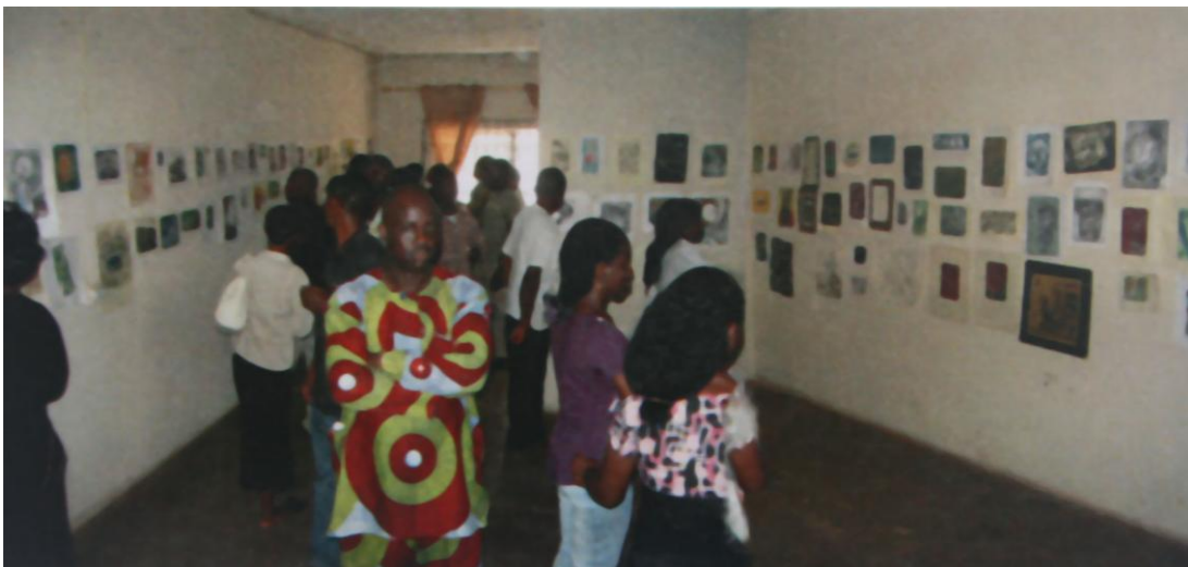
Fig. 8: The exhibition in Ana Gallery