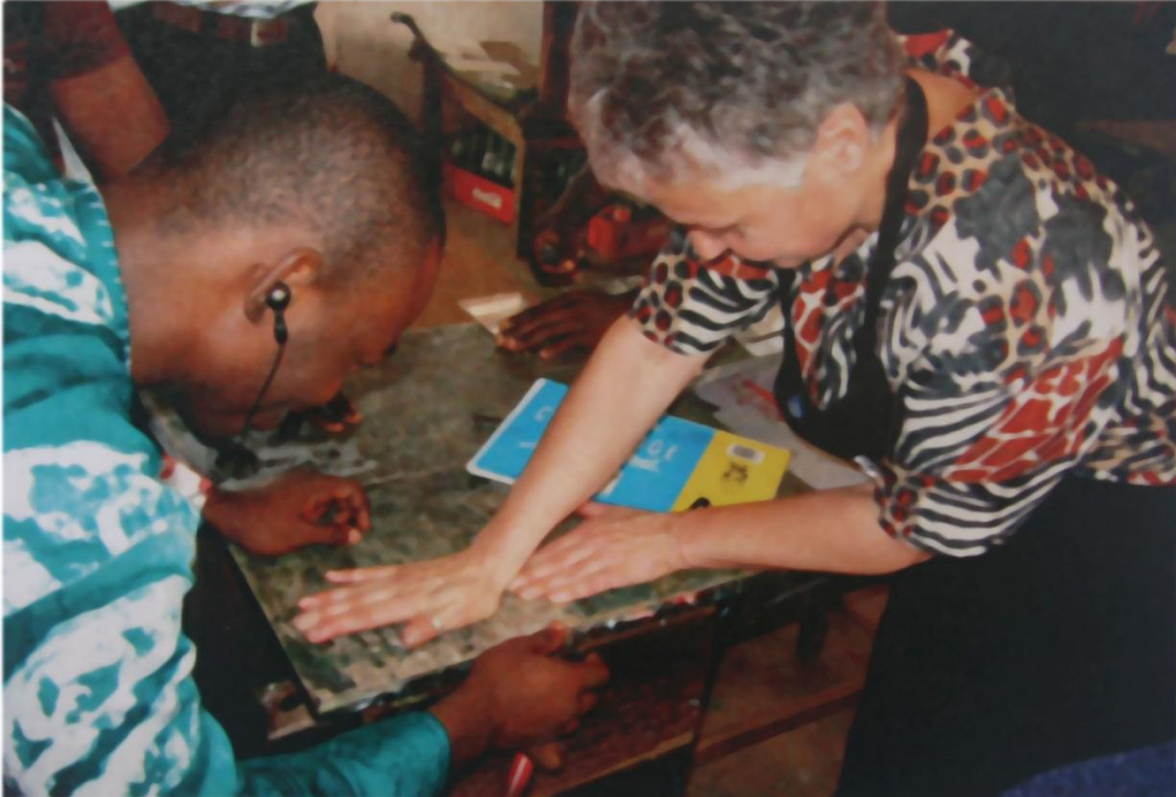
Fig. 2: Beveling the edges of the plate

scratched with the sharp tools print black in black ink, the sandpapered areas leave grey impressions. Meanwhile, before the plate is inked, its sharp edges are filed down to prevent damage to the blankets of the press or the printing paper (fig. 2).