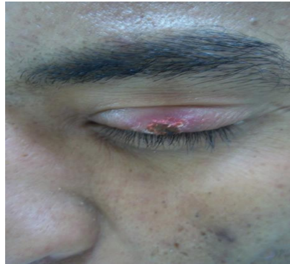
Figure 3. Cutaneous leishmaniasis of the left upper lid without involvement of the anterior segment of the eye.

Figure 2. Erythematous and nodular lesion of the upper lid with central crust