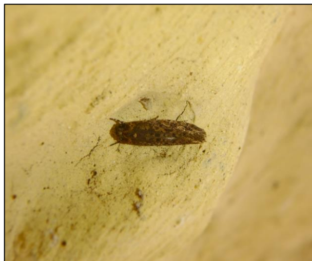
Figure 8 – Live photo S. rutella , wall at Cole’s courtyard, Jamestown

imagines of a so far unknown Tineidae had been found sitting on the walls outside the buildings (Fig. 8) or inside the bathroom. This is a very urban area (Fig. 9), and it was expected that this would be an introduced species rather than an endemic one.