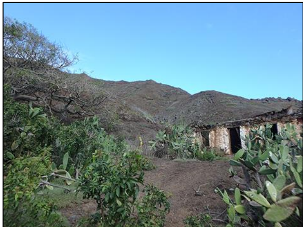
Figure 7 – Opuntia plants and former garden land, an example of habitat for A. siccata on St Helena (T. Fowler)