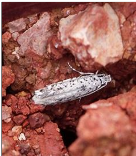
Figure 6 – Live photo A. siccata , Burnt Rock, on soil.

The records of A. siccata on St Helena are mainly from man-made habitats, such as plantations and gardens, and the ruderal tertiary vegetation following the destruction of secondary habitats by grazing goats. The species is established in areas at low and middle altitude.