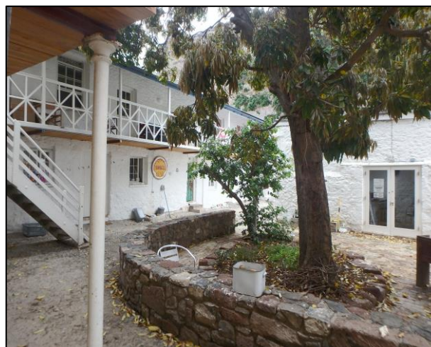
Figure 9 – Habitat of S. rutella in Cole’s courtyard, Jamestown: ensemble of buildings and walls with a Mango tree in the middle (T. Karisch)