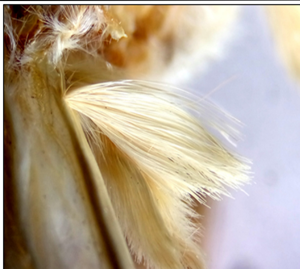
Figure 3 – Basal hair brush on basal posterior margin of Phassodes vitiensis (Bishop Museum).