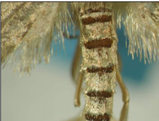
Figure 2 – Close-up of the abdomen with dark, tergal spinning, of the male Filiramifera naumanni gen. nov., spec. nov.

Male genitalia (Fig. 4). Uncus with two widely separated, acute lobes, attached to the broad, hood-like tegumen; gnathos U-shaped, without subscaphium; juxta a slender band connected to phallic apparatus in vertical position; vinculum moderately short, attenuated into an elongate saccus; unsclerotized transtilla present connecting valval apophyses on dorsal sides; valvae with basal half (sacculus) broad, dorsal and ventral sides convex, distal half more slender and rounded apically, ventral margin of sacculus with short, acute process, apical thorn absent, ventral margin of cucullus with prominent, triangular,