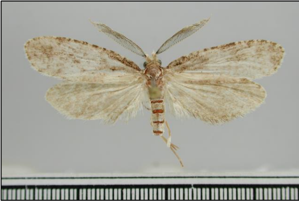
Figure 1 – Male holotype of Filiramifera naumanni gen. nov., spec. nov. The thick bars on the scale indicate 5 mm intervals.

deciduous; proboscis absent; thorax dark brown, forelegs dark brown, paler on articulations, epiphysis longer than tibia, all legs covered by short, acute scales, spurs 0.2.4., praetarsi with small arolium, tibiae without ventral spines; abdomens with tergal spining present across posterior margins (Fig. 2); forewings grey-brown with darker spots along costal margin, venation heteroneurous (Fig. 3), microtrichia present on dorsal wing surface, forewing with accessory and intercalary cell (due to bifurcation of M in cell) present, longer than their stalks, radius 5-branched, R1 arising from base of discal cell, basal part of Cu2 present, fading towards wing margin, A1 and A2 forming anal loop at base; male retinaculum a broad, shallow lobe arising from wing membrane between C and Sc, male with single frenular bristle on hindwing costa.