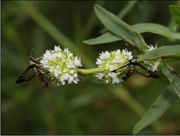
Figure 3 – Lophocephus quinquepuncta was very abundant in the riverine forest of Chute de Ditinn, often a couple of specimens were present on the same plant.

were found during the systematic check of the flowerheads. During about an hour's search, more than 15 specimens were seen, plus a small, unidentified Episannina (Sesiidae, Sesiinae) specimen, all nectaring on the same plant species. On the 10 th July he returned to look for further Sesiids were observed between 12h30 and 13h30 but no nectaring Sesiids were observed during this time. On the same day, the first specimen of L. quinquepuncta appeared at 14h45 and by 15h30 another five specimens were observed nectaring. A rather larger, metallic blue and black Episannina specimen was also observed and captured for identification.