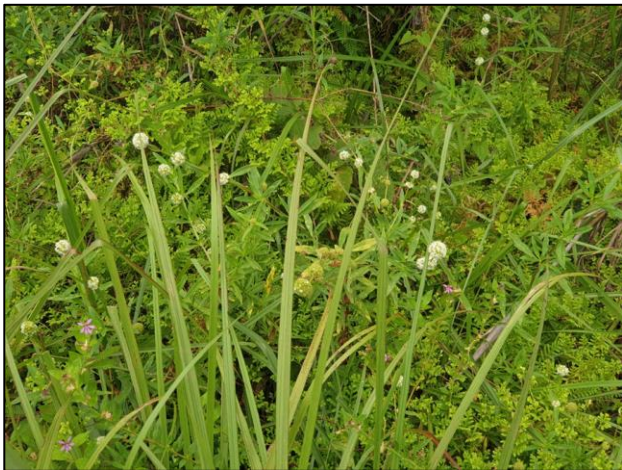
Figure 1 – Stands of Shrubby False Buttonweed — Spermacoce verticillata along forest glade at the foothills of Nimba Mountains, Liberia.

In Guinea and Liberia it is well established in primary and secondary grasslands and savannah habitats, also grassy forest edges mainly in hilly country of the Nimba Mountains and in the Fouta Djallon, where it can be amongst the commonest flowering plants during the rainy season between May and October.