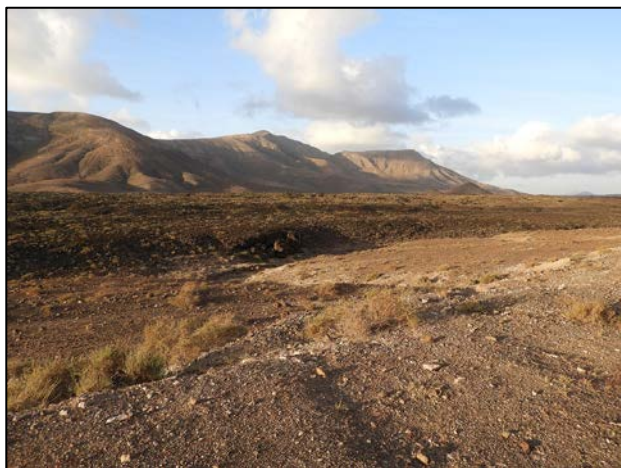
Figure 5 – Luffia kirsteni sp. nov. Type locality. Fuerteventura: Barranco tras del Lomo.

Material examined. SPAIN. Canary Islands. Tenerife. Anaga, Roque Negro, 615 m. 2 specimens, 7–9.viii.2018 leg. et col. Knud Larsen. The species was abundant at the locality, which is very misty, humid and with plenty of lichens everywhere. According to Sobczyk (2002) the flight period is May/June.