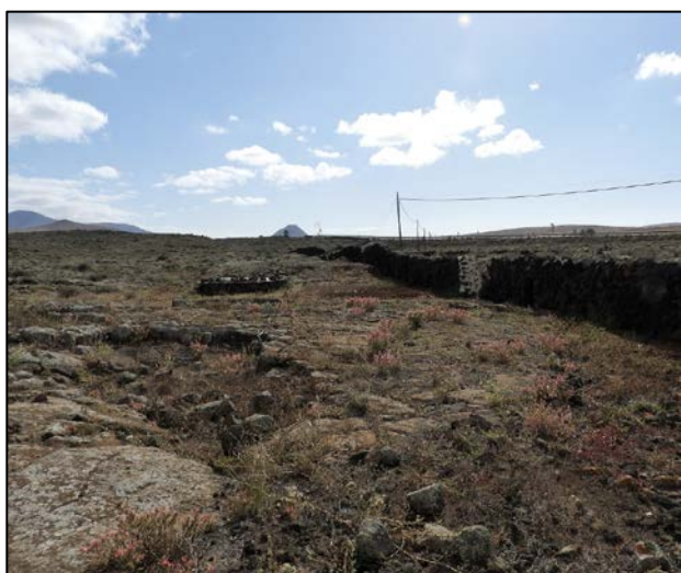
Figure 6 – Luffia kirsteni sp. nov. Second locality. Fuerteventura: Lajares.