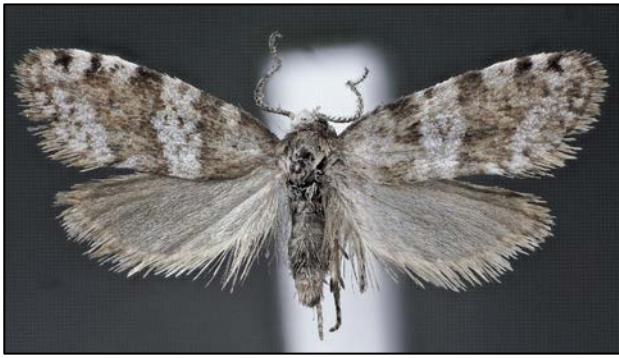
Figure 1 – Luffia kirsteni sp. nov. Holotype ♂, 13 mm. Barranco tras del Lomo.