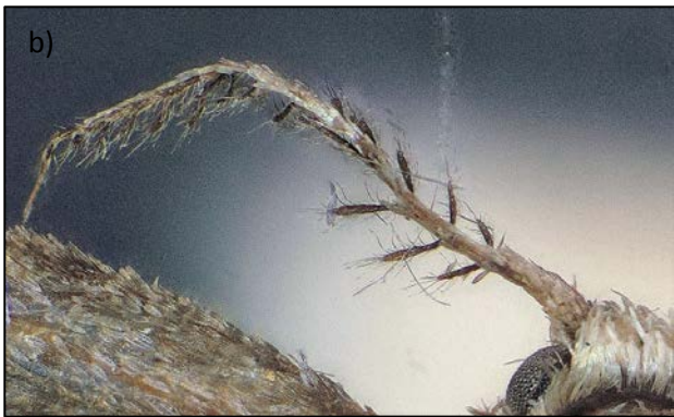
Figure 2 – a) Luffia kirsteni sp. nov. Antenna. Lajares. b) Luffia lapidella (Goeze, 1783). Antenna. France. Ariège.

brownish tint. The underside of the forewing is like the upper side but the markings are very weakly visible. The underside of the hindwing is light grey. Legs are grey with long tibia and the distal segments are brownish ringed.