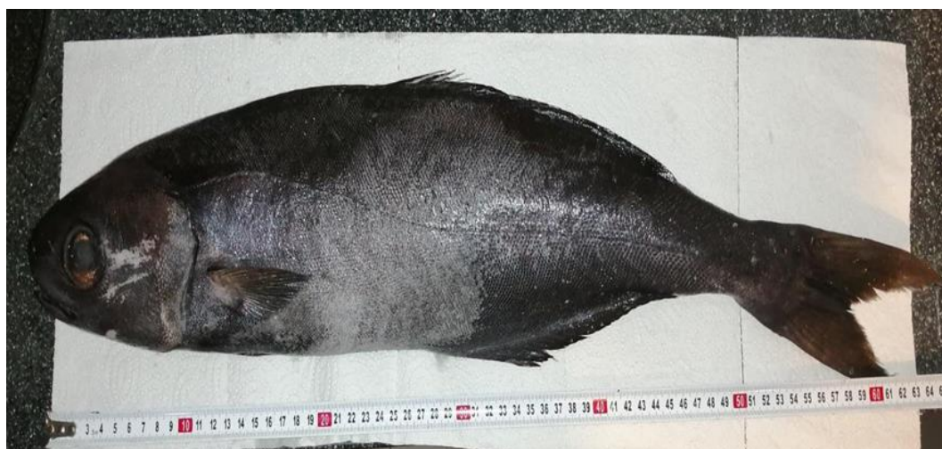
Figure 2. Centrolophus niger from Burhaniye coast, Edremit Bay.

A single C. niger specimen has a total length of 65.1 cm (Fig 2). Diagnostic characters were dorsal fin rays IV+33, anal fin rays III+21, pectoral fin rays 21, and pelvic fin rays 6. Body elongate, color bluish/purplish, pectoral and pelvic fins darker than body color. Large mouth with no teeth on the palate, snout longer than eye diameter. All these characters closely correspond to those listed by Muus and Nielsen (1999), Ceyhan and Akyol (2011), Ayas et al. (2018), and Cengiz et al. (2019a).