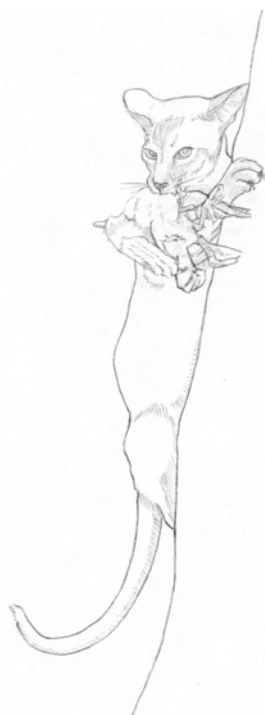
FIGURE 1. Artist's rendering drawn from local Malagasy descriptions and confirmed likeness of a fitoaty . © Joel Borgerson

The morphology of wild living cats in Madagascar has been described as "easily distinguishable from domestic cats" (Brockman et al. 2008: 137). Their pelage is similar to that of wild living cats elsewhere in the world (Goodman et al. 2003; for a description of typical pelage cf. Daniels et al. 1998) and is characterized by an underlying agouti/tawny brown coat with overlying dark grey tabby patterning, a dark banded tail, and lack of variation in coat pattern (Daniels et al. 1998, Goodman et al. 2003, Brockman et al. 2008). They have also been described as larger than domestic cats (both in overall weight, height, and length), and as exhibiting significant sexual dimorphism (males twice as large as females) (Goodman et al. 2003, Brockman et al. 2008). While most wild living cats around the world have tabby coats, some wildcat ( Felis silvestris ) populations in Scotland exhibit a variety of coat patterns including "primarily