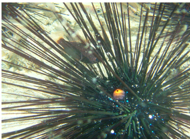
FIGURE 2. Siphamia versicolor with Diadema setosum . Photograph taken at a shallow sandy site (Site 9) where Diadema provided the majority of cover.

dance data in biological monitoring of environmental impacts and show community structure (Clarke and Gorley 2006). In this study we used SIMPEROF, a methodology that identifies the species primarily providing the discrimination between two observed sample clusters. Initially, a pre-treatment was carried out on the data set; a square root transformation was applied to the data in order to downweight any dominant contributions of particularly abundant species in samples (Clarke and Gorley 2006). A resemblance matrix was then produced to show the similarities between pairs of samples using Bray-Curtis similarity; a step necessary prior to any further analysis. Bray-Curtis similarity is the most commonly used similarity coefficient for biological community analysis, as it reflects differences between samples based on community composition and total abundance (Clarke 1993). A CLUSTER dendrogram was produced, showing the hierarchical clustering of samples going into smaller numbers of groups as their similarity to each other diminish