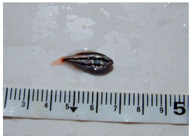
FIGURE 3. Siphamia versicolor (same individual as Figure 2). The cardinalfish appears to be red-black in colour until stressed when the lines become visible.