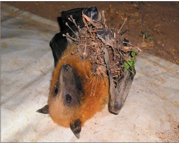
FIGURE 2. Pteropus rufus snared using hook-like plant burrs whilst feeding on kapok trees near Kirindy-Mite National Park