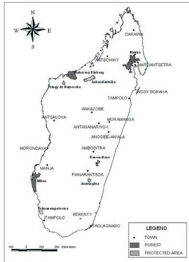
FIGURE 1. Map of Madagascar showing the location of protected areas and towns names mentioned in the text and Table 1.

In this review we collate data on bats as bushmeat, both published and unpublished, and report on general trends with respect to hunting methods, consumption patterns, conservation threats and human livelihood issues. We draw on personal experience in the field since 1998 (PAR) and 2002 (RKB) and have augmented the accounts by personal reports from our Malagasy colleagues engaged as either employees or students in successive projects organized by the University of Aberdeen and funded by the Darwin Initiative (1999-2005). Information on bat hunting was obtained through direct observations as well as informal discussions with people in a range of sites across the island (Figure 1).