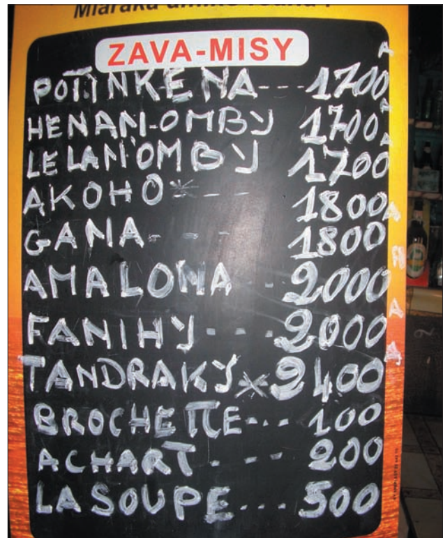
FIGURE 7. A menu in a roadside restaurant in western Madagascar during July 2007 showing the price of fruit bat fanihy as 2,000 ariary or $1 US. Other meats on the menu are omby (beef), akoho (chicken), gana (duck), amalona (eel) and tandraky (tenrec).

considered hunting to represent a minor threat to P. rufus in the north of Madagascar, but noted that this species was frequently served in local restaurants. Other evidence suggests that, at least locally, current patterns of exploitation are unsustainable and this is obviously of concern to conservationists and those who depend on the bats for income and nutrition. Local