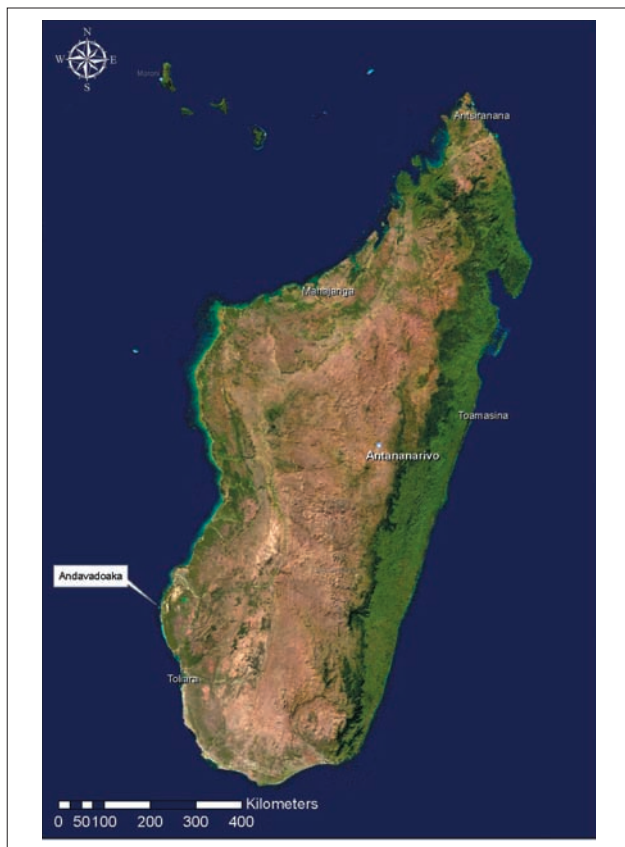
FIGURE 1. Location of the Andavadoaka region, southwest Madagascar.

2000). Limited employment opportunities, combined with low agricultural productivity, resulted in a five-fold increase in the fishing population in a period of 17 years leading up to the early 1990ties, causing an overexploitation of marine resources, especially near urban centres such as Toliara (Gabri  et al. 2000). Laroche et al. (1997) provide evidence that over-fishing in the Toliara region has led fishers to target lower value fish in an effort to sustain yields in the face of reduced stocks of large piscivorous species. At the beginning of the new century, over 50% of the artisanal fishing in Madagascar was estimated to occur along the reef systems of the southwest (Cooke et al. 2000). The village of Andavadoaka, at the geographical centre of this project area, has seen a doubling of population input rate (births and immigration arrivals per year) in the 10 years leading up to 2003, with over 50% of the population being aged 14 or under. Fishing is the primary economic activity for 71% of villagers (Langley et al. 2006).