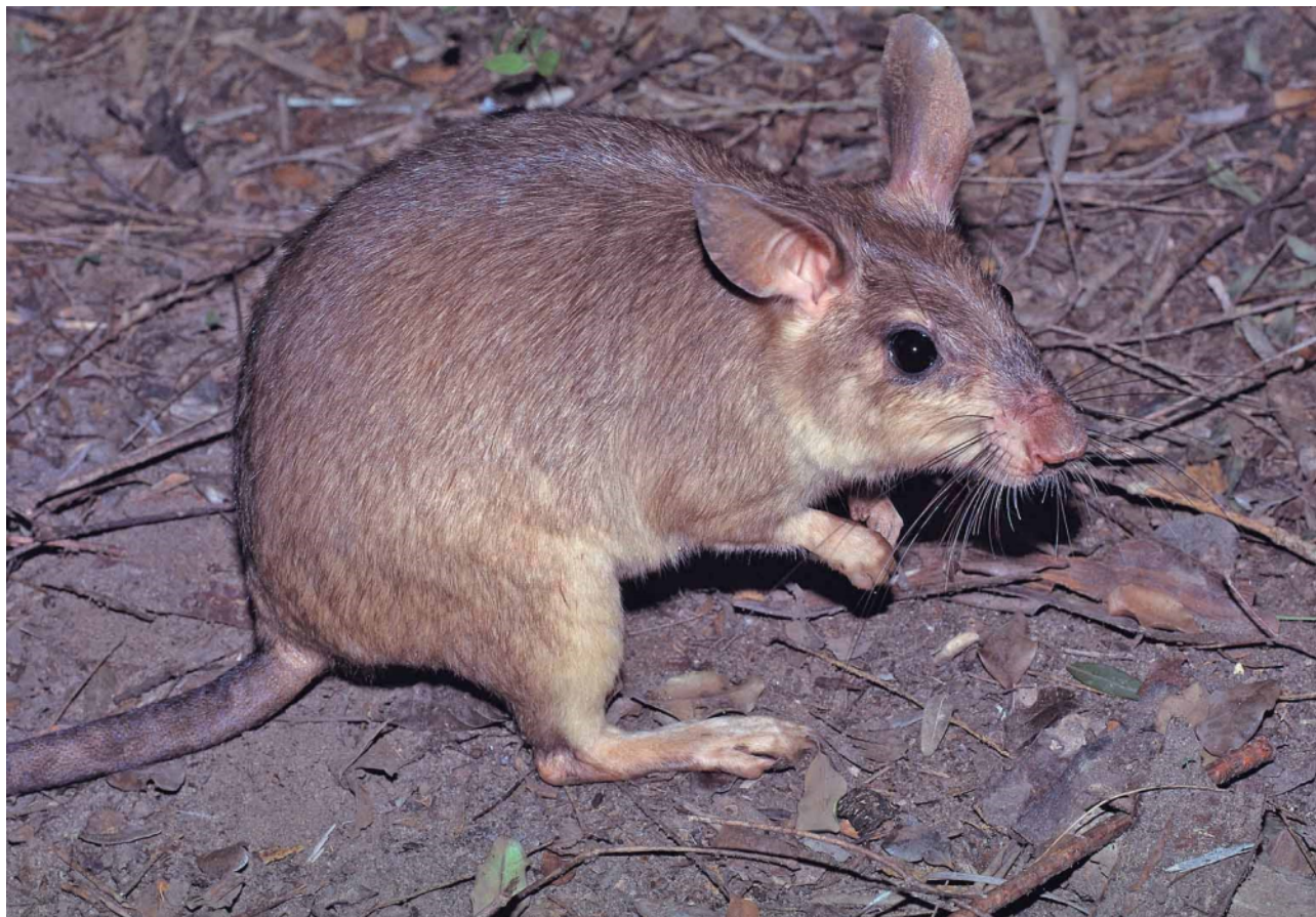
Figure. Giant jumping rat ( Hypogeomys antimena ) found only in the Menabe forests.

But not everything is negative when we talk forests in Madagascar. There is a bunch of “better” news. For instance, the park of Mikea in southwestern Madagascar is famous for its dry spiny forest but also for the ravaging fires and deforestation which occurred in 2013, several months after cyclone Haruna disturbed the area in February of the same year. A total of 784 fire alerts (MODIS) have been reported in 2013 when the mean number for the years before was around 60. In 2020, the number decreased to 16 and only four