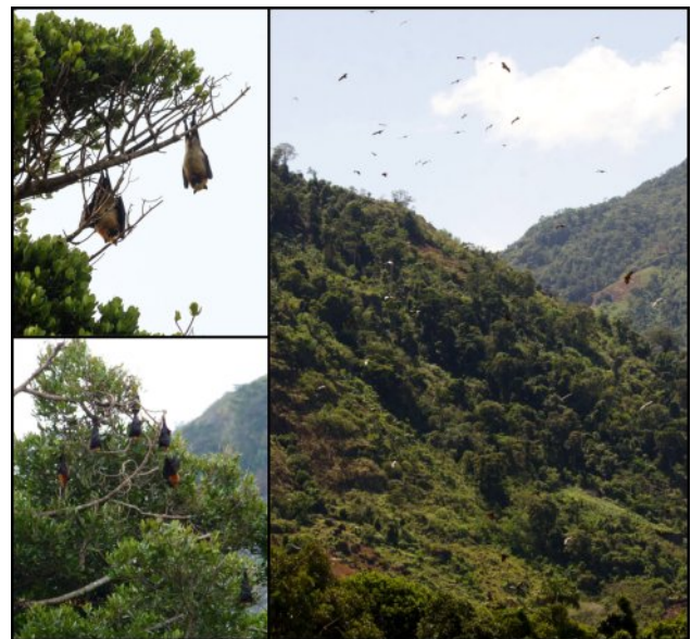
Figure 2. Roosting and disturbed Madagascan flying foxes ( Pteropus rufus ) at the Amborabao colony, assessed during this study (September 2015).

ANALALAVA (ANTRANOPANIHY). This unprotected parcel of littoral forest is relatively isolated, situated on a small island cut off by the arms of an estuary (Asihanaky), making it accessible only by pirogue. The forest and roost are ca. 3.6km from the nearest village, Ambanihazo and at an altitude of just 15m. Our colony