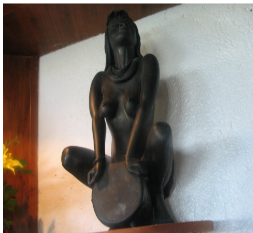
Figure 4: “Lady and drum.”

The two carvings were elevated on a mantelpiece in a restaurant, and were visible to guests as they dished out their food. Struck by these images, I interviewed a few guests for their reactions to them. Most females, locals and visitors to the country, displayed a discomfort with what they labeled as “pornographic overtones” of the artifacts. Others simply viewed it as an innocent artistic expression.