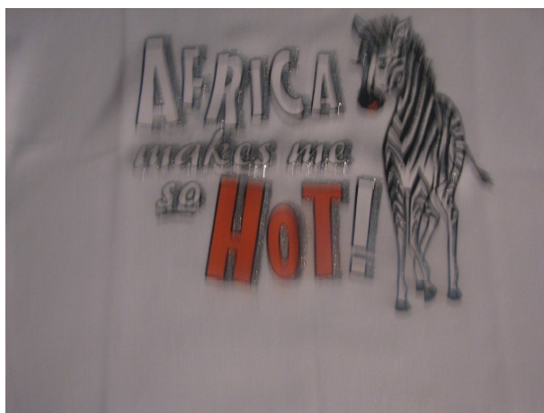
Figure 5: T-shirt inscription “Africa Makes me so Hot!” Picture of a t-shirt displayed in a curio shop at Mowana Lodge, Kasane.

imprint is accompanied by a drawing of a sexualized zebra. This t-shirt recalls constructs of African female sexuality through a humorous and sexualizing play on images of the “wilderness” and atmospheric temperature. Animal depictions evoke stereotypical representations of African female sexual exoticism, lasciviousness, and savagery. These imaginations provide justification for female conquest and domestication by the imperialist male.