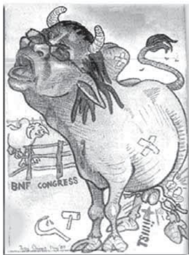
Figure 2: Cartoonistic impression of Kathleen Letshabo. Mmegi Monitor (28 May, 2007).

The other particularly informative negative depiction of African womanhood can be seen through an infamous cartoon by Billy Chiepe about a Botswana female politician, Kathleen Letshabo.