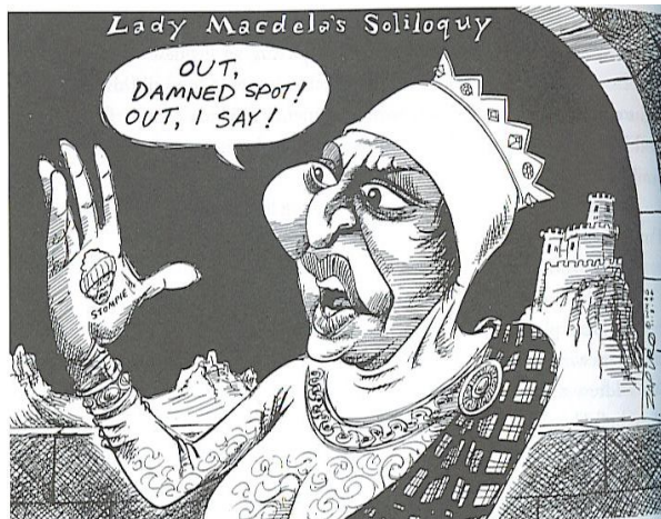
Figure 1: Winnie Mandela as Lady Macbeth. Cartoon © Zapiro. Reproduced in Pieter-Dirk Uys (2002).

Winnie's image in contemporary forms of popular culture builds upon the image of Mantatisi—the surrogate military commander who sowed seeds of destruction. This type of imaging is evident in the creation of South African cartoonist illustrator, Jonathan Shapiro, popularly known as Zapiro. The cartoonist builds on the political memory of Winnie and South African politics conjoined with the memory of Shakespearean dramatic representations of women.