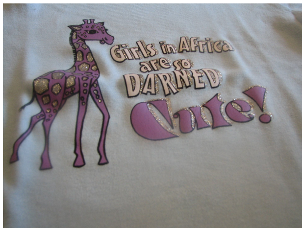
Figure 6: T-shirt inscription, “Girls in Africa are so Darned Cute!” Picture of a t-shirt displayed in a curio shop at Mowana Lodge, Kasane.