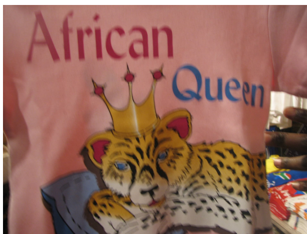
Figure 7: T-shirt inscription, “African Queen.” Picture of a t-shirt displayed in a curio shop at Mowana Lodge, Kasane.

In depicting Africa and African female sexuality, the animal surrogates the woman as a sign of value and identification. Yet in this surrogation the