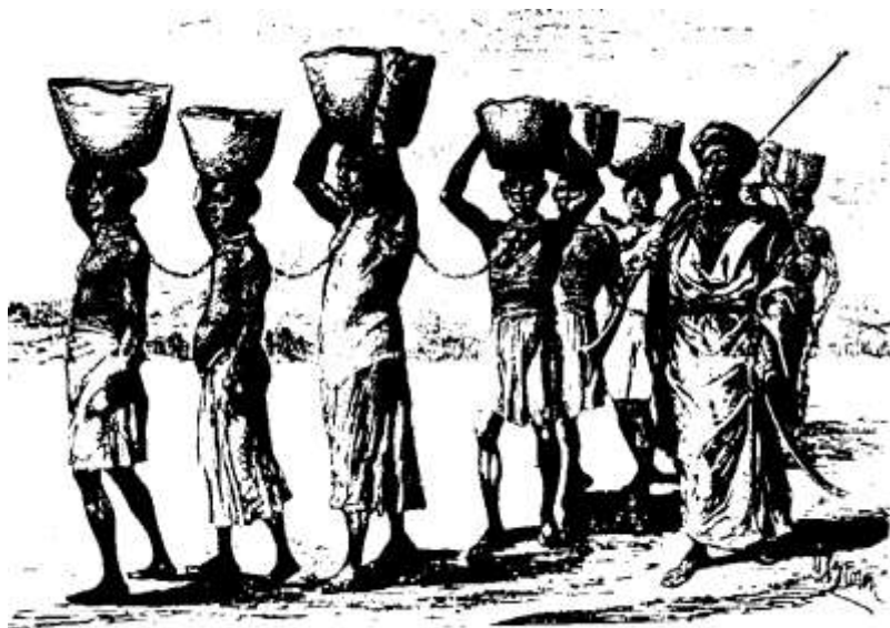
Fig. 2: Slave Procession in East Africa (Source: Alexander, 2001).

Though the concept of de-humanization can escape the definitional boundaries of what constitutes slavery to issues of global human trafficking for instance, the concept is more or less associated with slavery. This was the reason why many slaves were maltreated, de-humanized and even killed without any socio-political intervention. Though some religions like Islam and some African societies and cultures frown upon de-humanization of slaves had been the major fulcrum of the characteristics of slavery. The de-humanization of slaves was more pronounced in the European model of slavery where slaves were forced to walk and work even when they were ill. Failure to do so was tantamount to severe punishments including death. Special chains were also used to tie slaves like animals (see Fig. 2).