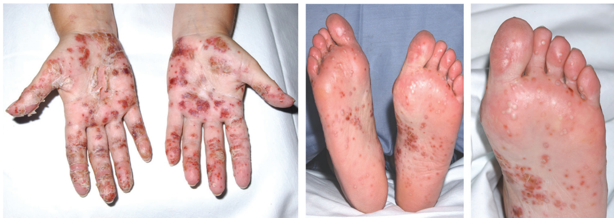
Fig. 1. The acute eruption of painful pustules on the palms and soles.