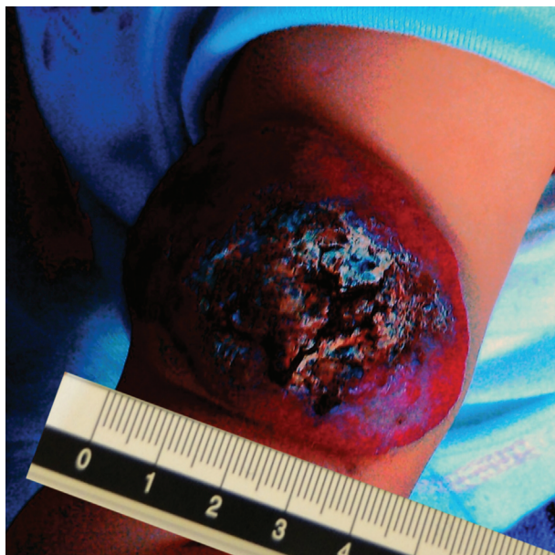
Fig. 1. Initial appearance of haemangioma prior to commencing oral propranolol.

ideas and results and, if these are confirmed, a paradigm shift occurs with the rejection of conventional theory and acceptance of the new standard. Breakthroughs commonly occur serendipitously in all branches of science including medicine. Serendipity is the propensity for making fortuitous discoveries while looking for something unrelated. An important aspect is the 'sagacity' of being able to link together apparently unrelated facts to